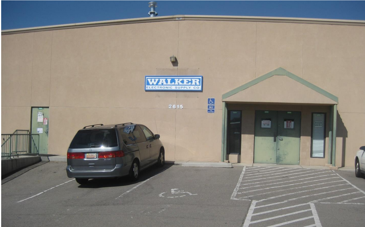
2615 Princeton NE in September 2011