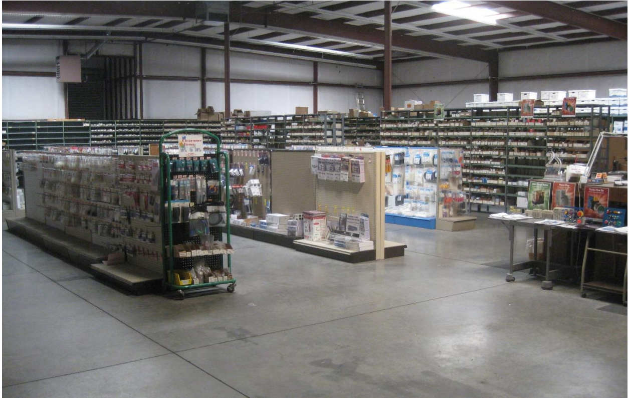
Some of the warehouse area in 2615 Princeton NE