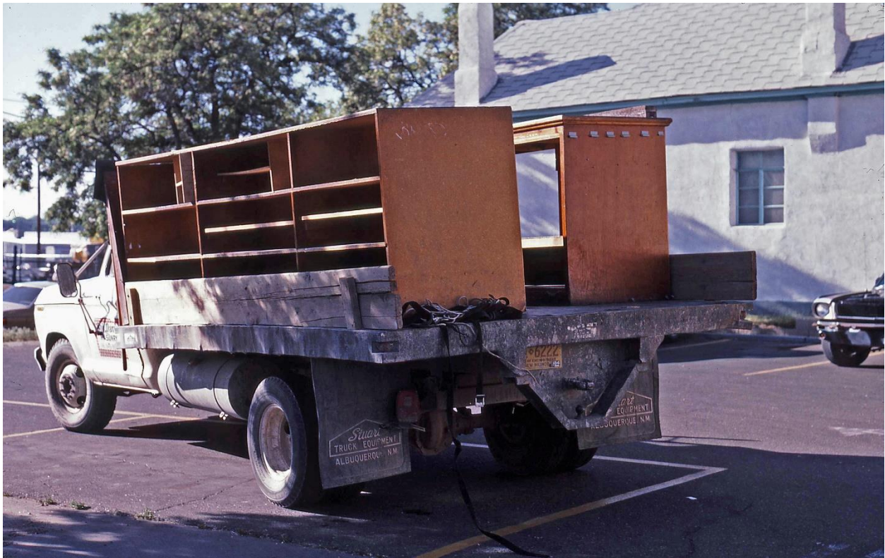
Moving the sales counter