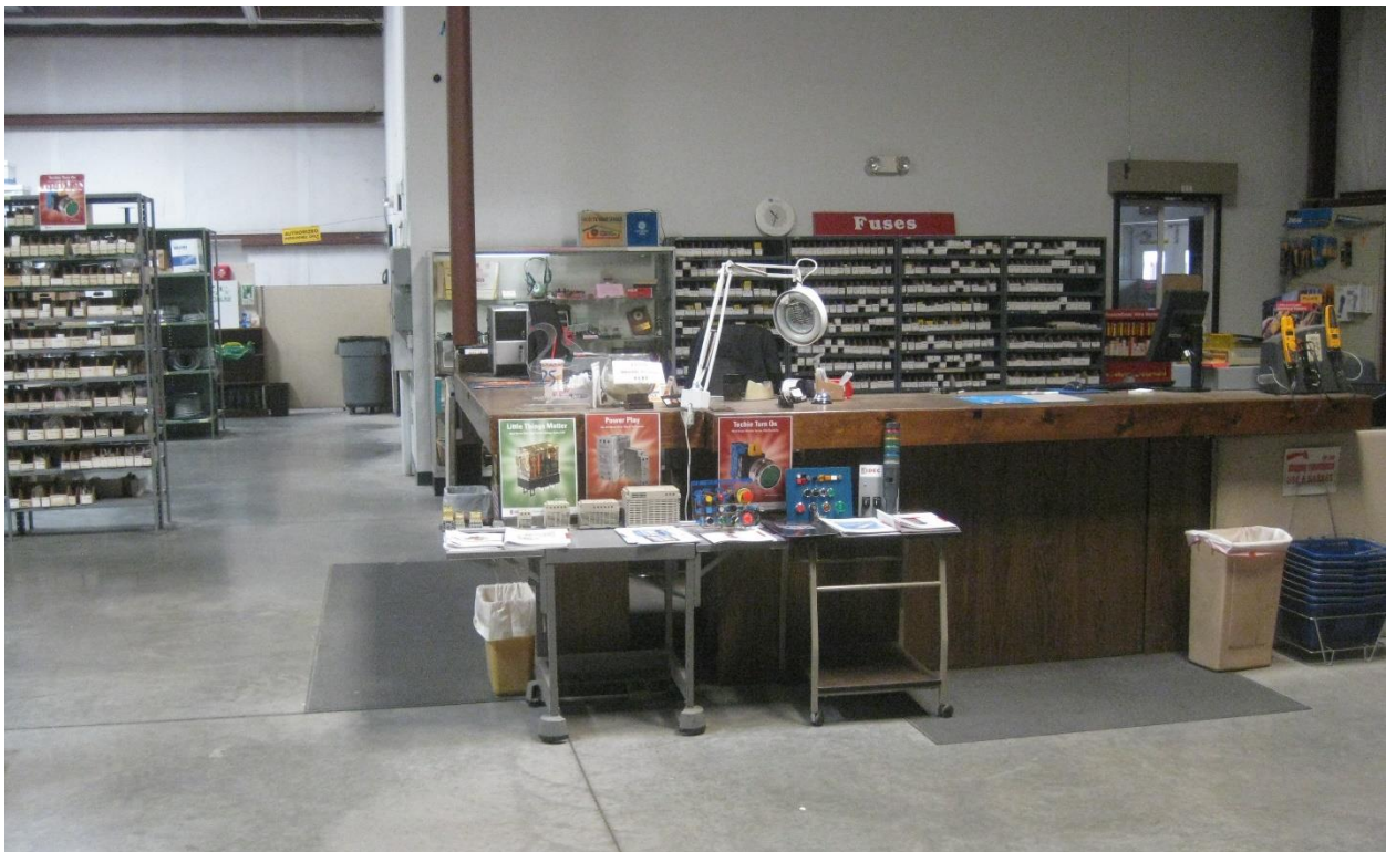
The sales counter in 2615 Princeton NE