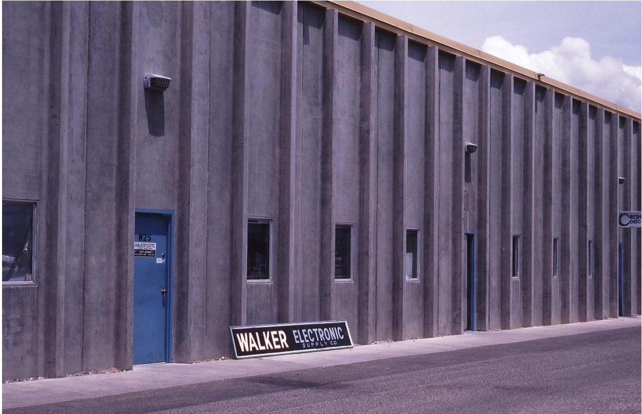
The temporary location at 3300 Princeton NE