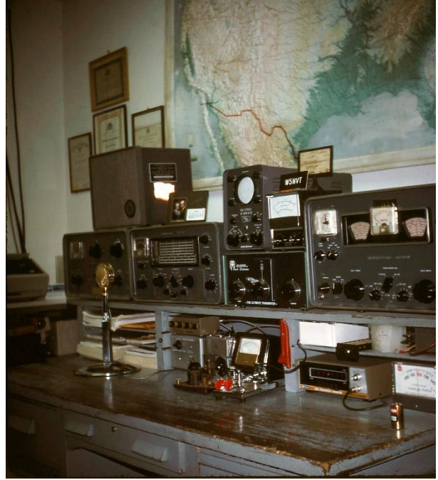
Len's ham radio setup in the back office (1977)