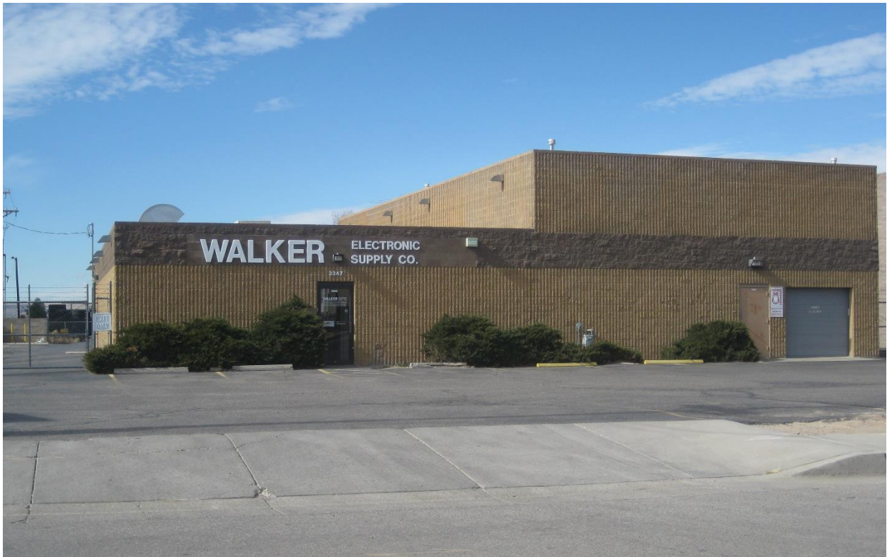
The building at 3347 Columbia NE (picture taken in 2011)