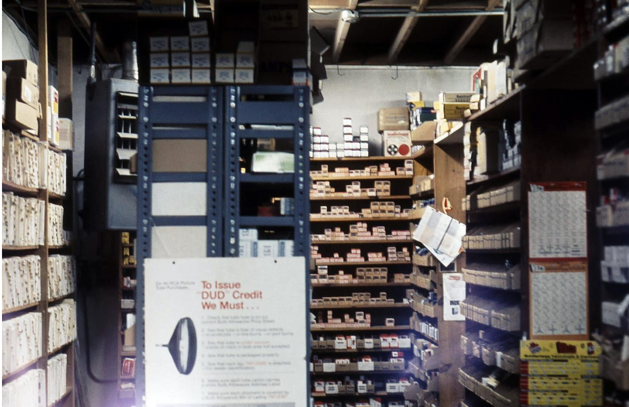
Part of the warehouse area in 1971